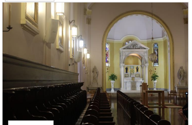
Ella Day Yr9