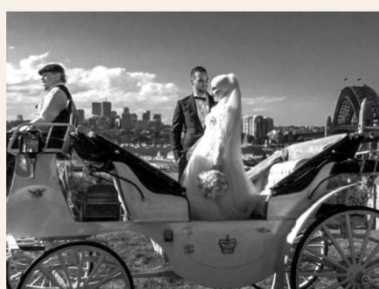
2018 Secondary Years 9-10 Semi-Finalists

A lovely picture, Matilda. You have a very good eye for what makes a good photograph.