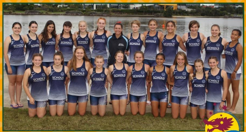
2018 AusDBF Australian Dragon Boat Racing Championships